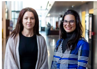
The full international team : The Saint-Étienne team (on the left) and the Aix-Marseille-Provence Campus team (up above).