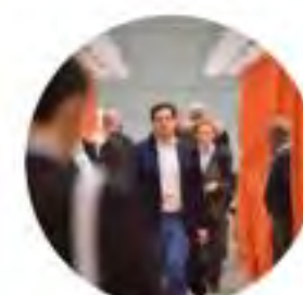
One To One Meetings